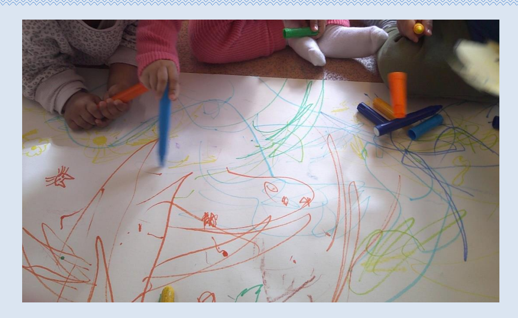
<u>Piglet Room News</u>

The book of the month in the Piglet room in March was The Very Hungry Caterpillar. The children have taken part in a number of activities to learn about this story, including potato printing to make a hungry caterpillar picture with red and green paint. The children were a bit confused as to why they were using a potato to make marks at first, however loved the activity! They have been learning about healthy and unhealthy foods on the black tray which was painted with a red half and green half. The children then were guided to place the healthy and unhealthy foods in the right place – green for healthy and red for unhealthy.